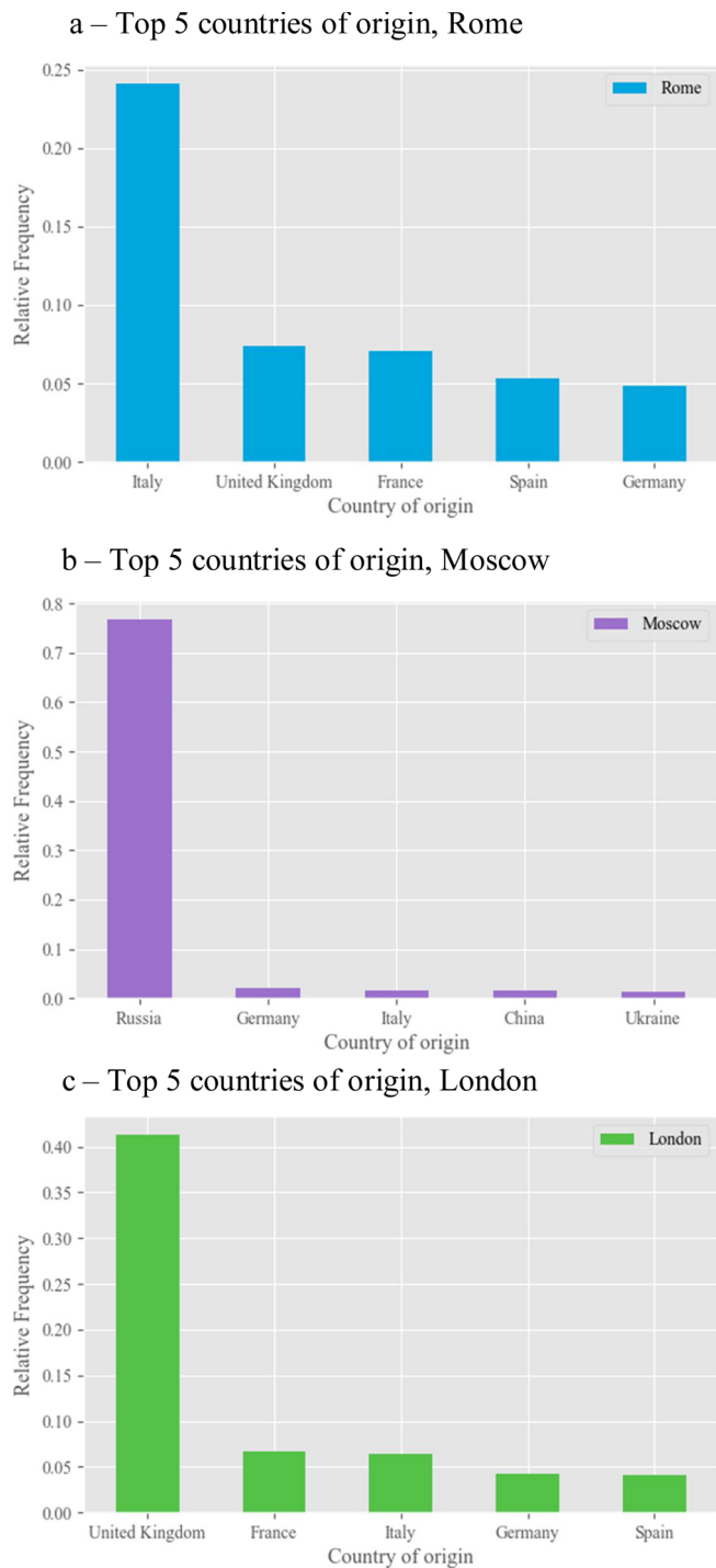
Fig. 1. a) Top 5 countries of origin, Rome. b) Top 5 countries of origin, Moscow. c) Top 5 countries of origin, London.

ECM (2017)). Despite their success in attracting tourism flows, these destinations are significantly different in terms of demand and supply, as well as benchmark culture, with London and Rome sharing similarities in terms of benchmark culture (Western) vis-à-vis Moscow (Eastern).